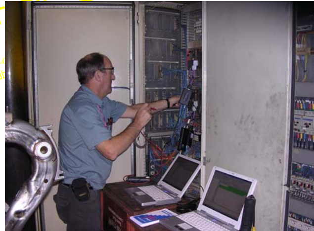
Fault finding in manufacturing

As a training organisation, we are quite open to using the consultancy visit as a training/learning exercise. However, for safety and accessibility reasons, we will have to limit the number of people observing the fault diagnosis and health checking to a maximum of two.