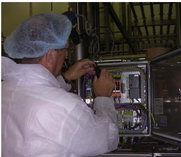
Fault-finding in the food industry

We can also provide rapid response call-out to help locate and fix problems on your plant. We will use modern analysis and waveform visualisation tools which can highlight network, system, wiring and layout problems. Typically, we can identify the causes of the problems and in many cases fix them during the visit. Finally, we can provide a system health check which verifies the fault free operation of your network.