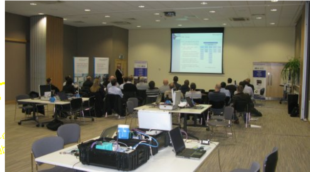
Training facility at Endress+Hauser, Manchester

The course is aimed at the professional engineer level and a basic familiarity with control system terminology and the ability to perform simple engineering calculations is assumed. Attendees must have previously attended the one-day Certified PROFIBUS Installer course.